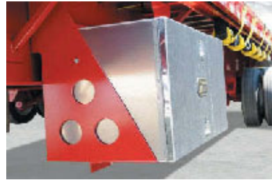
■ Tool Boxes