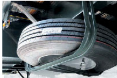
■ Tire Carriers