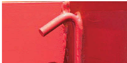
■ Rope Ties are welded to the side rail or under side of the trailer between crossmembers.