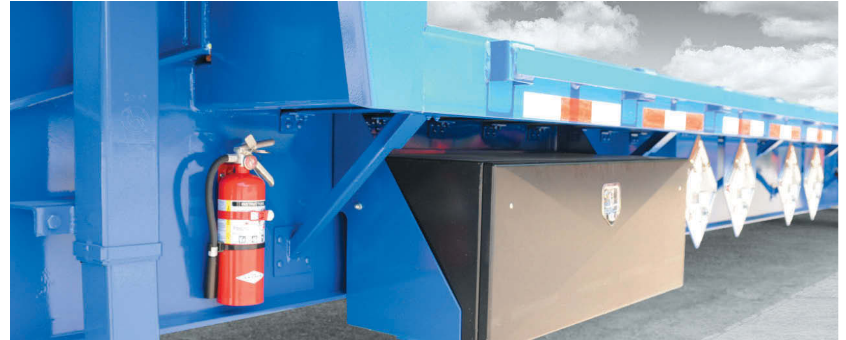
■ Customization The Freedom SE's versatile design can be customized to serve most markets.