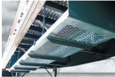
■ Side-Load Dunnage Rack