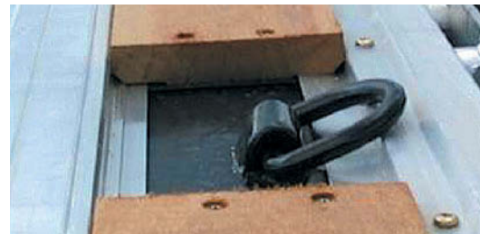
■ D Rings are recessed below the floor level.