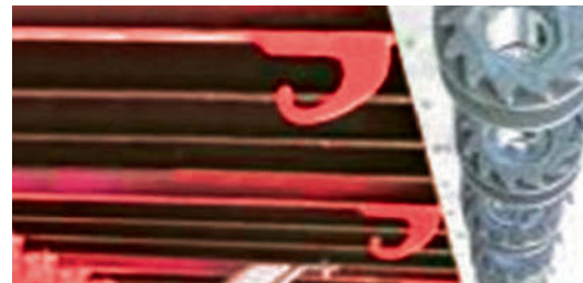
■ C Hooks are located on the underside of the trailer.