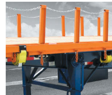
■ Custom Paint