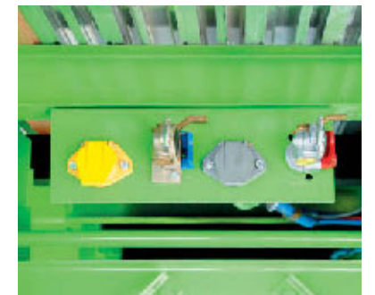
■ Air & Electrical Locations