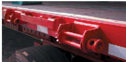
■ 3-Bar Winches make load securement fast and easy.