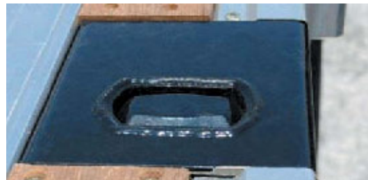
■ Twist Locks can be incorporated into the design for securement of containers atop the flatbed.