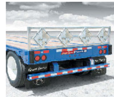
■ Special Load Options