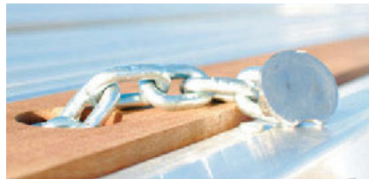
■ Pull Up Chain Ties