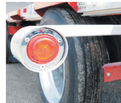
■ Options for Canada